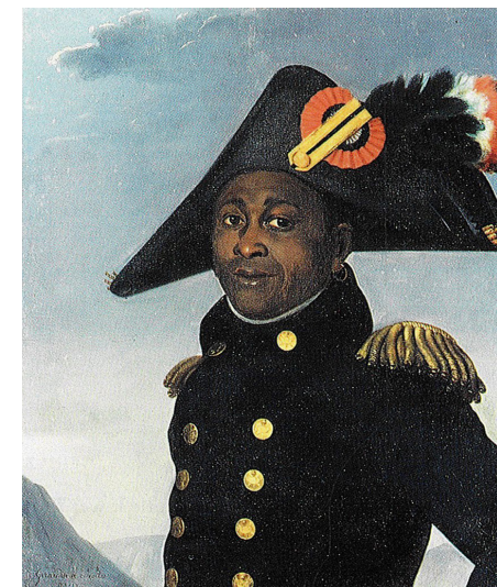
Toussaint Louverture GIRARDIN A NANTES AN '13 c. 1791–1804

The decision to curate this exhibition grew out of a set of circumstances, which in many ways are unique to Brown University. The John Carter Brown Library located at Brown University has one of the world's largest collections of documents and materials about the colonial period of Haiti. It has been extensively used by scholars and the material has been the basis of various exhibitions and books. What has not happened is that an artist has worked through the collection and then produced art inspired by the findings. Edouard Duval-Carrié, as the first artist-in-residence at the Library decided to do just that. In our discussions while he was at Brown, a recurring note was about the many images of Toussaint L'Ouverture, located in the library within books, documents, and various engravings. It was out of these discussions that this exhibition, The Many Faces of Toussaint L'Ouverture and the Haitian Revolution was born.