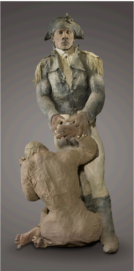
Toussaint Louverture et la vieille esclave OUSMANE SOW BORN 1935, SENEGAL 1989 Mixed media (iron, earth, jute, straw) H X W X D: 220 X 100 X 110 CM (86 5/8 X 39 3/8 X 43 5/16 IN.) MUSEUM PURCHASE, THROUGH EXCHANGE FROM EMIL EISENBERG, AND MR. AND MRS. NORMAN ROBBINS, AND WITH FUNDS FROM STUART BOHART AND BARBARA PORTMAN 2009-8-1