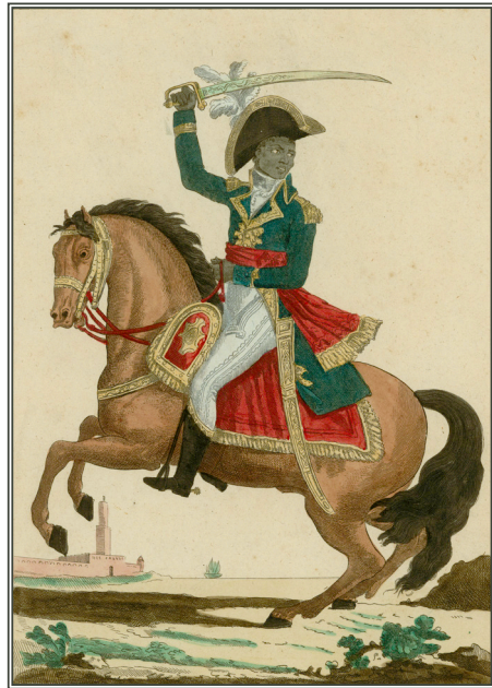
Toussaint Louverture Chef des Noirs Insurgés de Saint Domingue