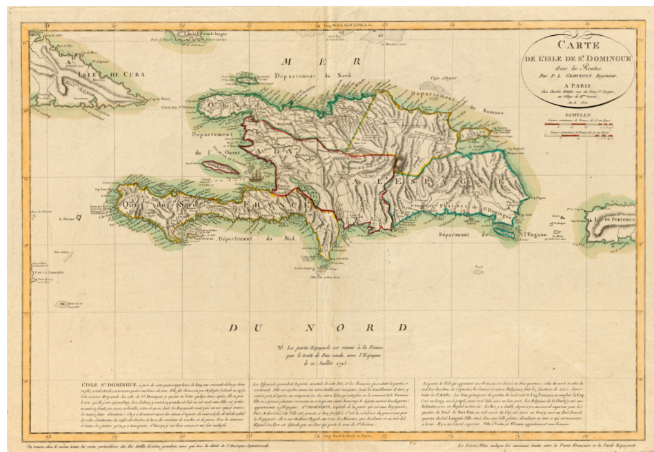
Carte de l’Isle de St. Domingue avec les routes par P.L. Griwtonn, Ingénieur P.L. GRIWTONN 1801

ORIGINALLY PUBLISHED IN THE EXHIBITION BROCHURE FOR THE OTHER REVOLUTION: HAITI, 1789–1804 PRESENTED BY THE JOHN CARTER BROWN LIBRARY AND NEW-YORK HISTORICAL SOCIETY, FEBRUARY 3 – APRIL 30, 2014.