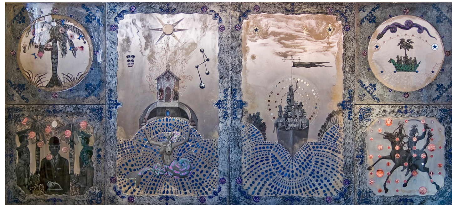
Memoire sans Histoire EDOUARD DUVAL-CARRIÉ 2009 COURTESY OF EDOUARD DUVAL-CARRIÉ

COURTESY OF THE JOHN CARTER BROWN LIBRARY AT BROWN UNIVERSITY