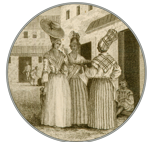
Costumes des affranchies et des esclaves des Colonies NICOLAS PONCE 1791